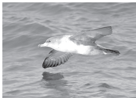
Pink-footed Shearwater From 2009 Monterey Pelagic Trip