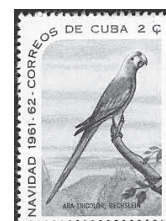
Cuban Stamp 1961-62