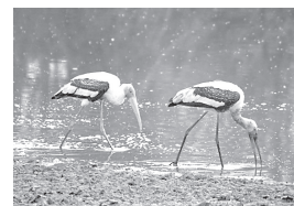
Painted Storks Adult and Immature

Asian Nature Transect: Enjoying the Wildlife of India, Bhutan and Thailand At the Effie Yeaw Nature Center, 7pm