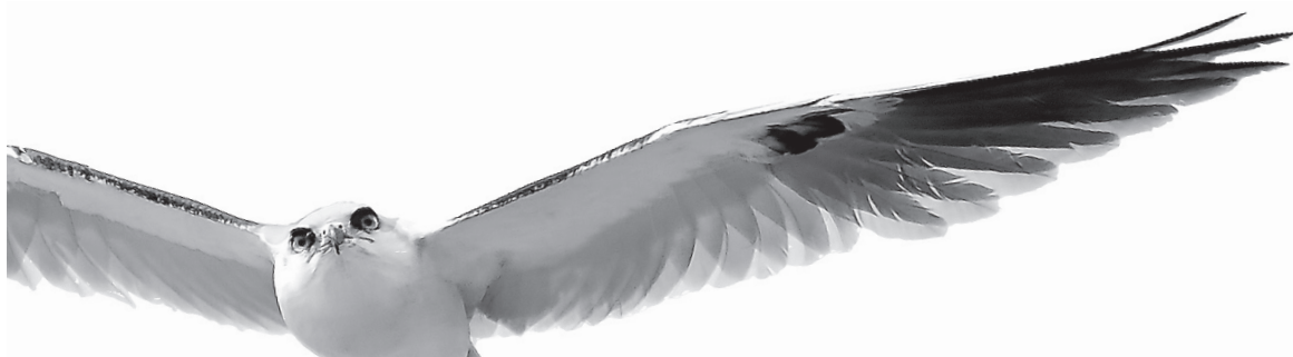
White-tailed Kite Dan Brown