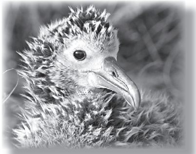
Laysan Albatross Kauai, Hawaii

Minutes of Board Meetings can be found online at sacramentoaudubon.org/societyinfo/archives.html . Scroll down to Board Minutes.