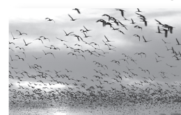
Cranes Rising from the Platte