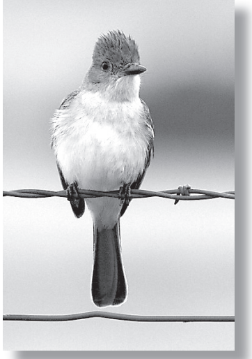
Ash-throated Flycatcher Linda Pittman

We can expect a different set of birds today from what we find during the winter months. Although most of the waterfowl have departed, now is the time for spring migrants and summer residents. We will be