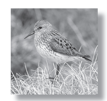
Western Sandpiper Breeding Colors Ed Harper

will tailor this presentation to the more conventional aspect of birding Alaska's more accessible hot spots. The program will visit Nome where the birding is very exciting and rewarding. In addition to seeing Spectacled Eider, Northern Wheatear, Arctic Warbler, and other mouth-watering birds, be prepared for Moose, Musk Ox, and Grizzly Bear! Other bird-