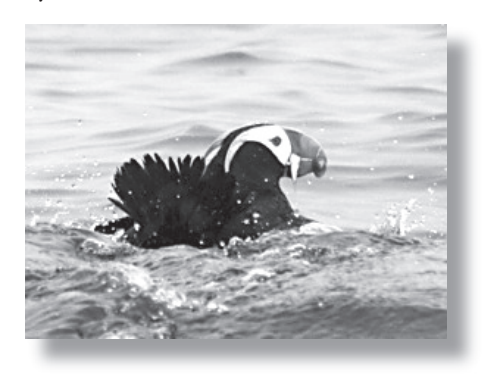
Tufted Puffin Linda Pittman

Pelagic birding, offshore on a boat, is very different from land birding and affords an opportunity to see species that are unlikely to be seen from shore. Sacramento Audubon Society offers two trips annually: the Farallon Islands in the Gulf of the