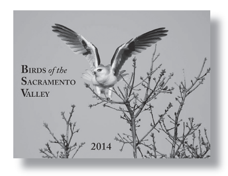
White-tailed Kite

Available at sacramentoaudubon.org/societyinfo/calendarorder.html