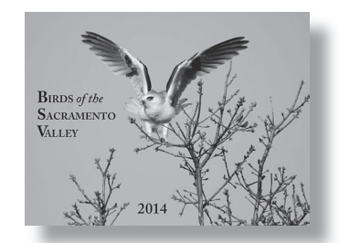
White-tailed Kite