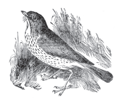
Thrush Species Unknown Artist