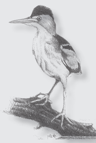
Least Bittern Daniel Kilby

When leaving through flooded fields adjacent to Bobelaine and the levee, at least 400 White faced lbises were seen with many flocks of Tundra Swans. What a killer surprise!"