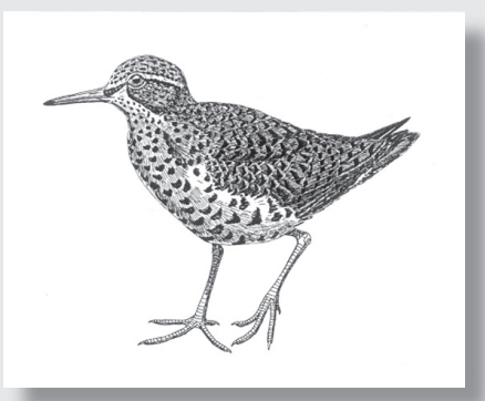
Spotted Sandpiper Stephen D'Amato