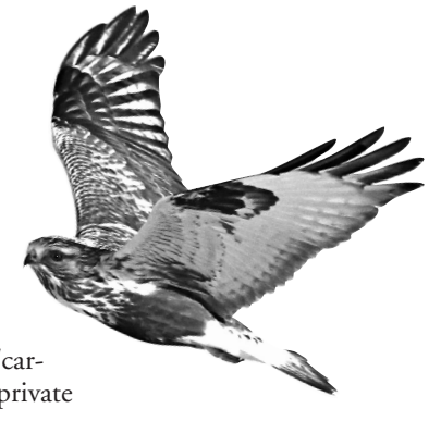
Rough-legged Hawk Photo Illustration

Due to insurance requirements, Sacramento Audubon leaders are not allowed to organize ridesharing/carpools. Participants are, however, encouraged to voluntarily share rides. Any carpool arrangements are private agreements between the driver and the passengers. Drivers must carry adequate insurance coverage. Please be courteous and share gas expenses with the driver. FRS radios can be helpful on all trips. Starting times are the actual time the trip leaves the meeting place. Try to arrive early, especially if you want driving directions or plan to carpool. Groups must make prior arrangements with the trip leader. In case of INCLEMENT WEATHER contact the trip leader for trip status.