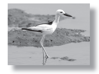
Crab Plover

bland, rocky escarpments and plateaus, acacia savannahs, mountain juniper forests, and expansive coastal areas. Freshwater is scarce throughout most of the kingdom, with most permanent sources having been diverted for farming and water supplies. Man has created new habitats with water storage reser-