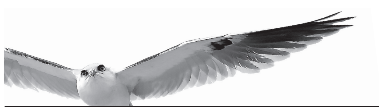
White-tailed Kite Dan Brown