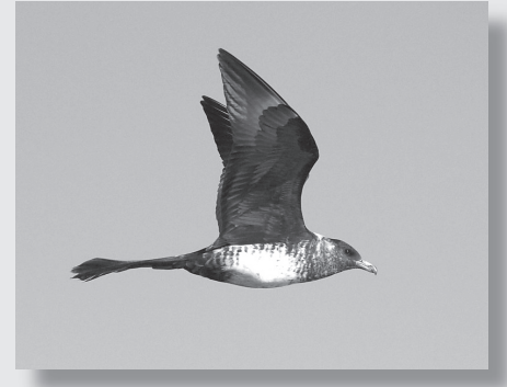
Pomarine Jaeger

Because of reports we were receiving, we then decided to head on out to Bodega Head at Bodega Bay and search for a Blue-footed Booby. This species had irrupted up the California coast recently, with many sightings. We hiked out