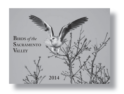
White-tailed Kite