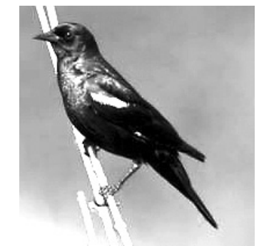
Tricolored Blackbird