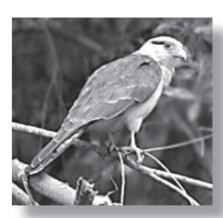
Yellow-headed Caracara at Iguazú Falls

General Meeting continued from page 1 agriculture as an advisor. Now he's trying to balance time between travel, part-time work as a biologist, playing music, chasing and photographing birds, and taking care of his home in Georgetown. Over a course of 40