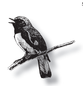
Black-throated Blue Warbler Stephen D'Amato

The Bufferlands are 2,500 acres surrounding the wastewater treatment plant between Sacramento and Elk Grove and not typically open to the public. Habitats include riparian forest, seasonal wetlands, grasslands, wildlife-friendly agricultural lands, and many habitat restoration sites. This is a good time of year to look for migrating